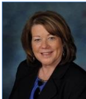
Head of School Lowell High School